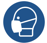
MASK (In Dusty conditions)