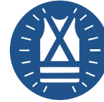
HIGH VISIBILITY CLOTHING