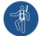
FALL ARREST HARNESS